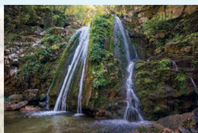
Waterfall near Olymbiada