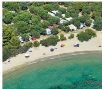
Areti Bungalows location

The Bungalows: Air Conditioning Free WiFi Self Catering Tennis Court Bungalows for 2/4 Car included