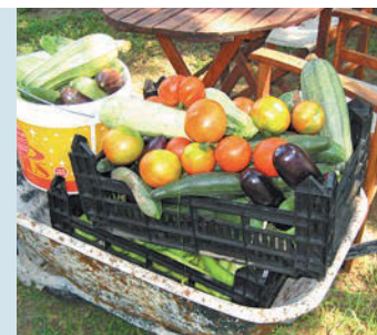
Organic veg from their own garden!

included (the area is known for its fresh mussels!) – only the more expensive of these items carry a surcharge. Although typically 'no frills' taverna fare, we believe the holiday prices here to be good value. If you have any dietary requirements please advise us at the time of booking. Please note that dinner for halboard guest start at 20.30 due to staff rotas (their Greek customers eat later!).