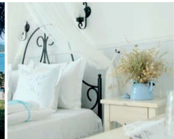
View from Liotopi Hotel