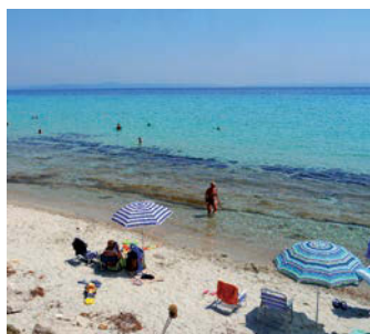
Beach below Blue Bay Hotel

The Blue Bay offers a very good balance. It has good facilities and levels of modern comfort, fine views and is within an easy walk of Aftos. But it also enjoys quiet rural surroundings, away from the bustle of this understandably popular village. The perfect location!