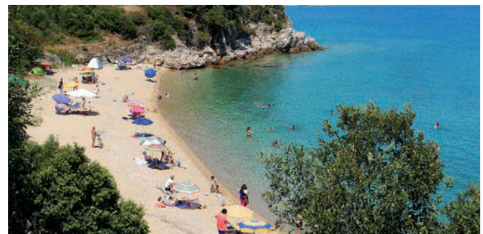
Stagira Beach, Olvmbiada

For further information and an idea of local cost please see our website.